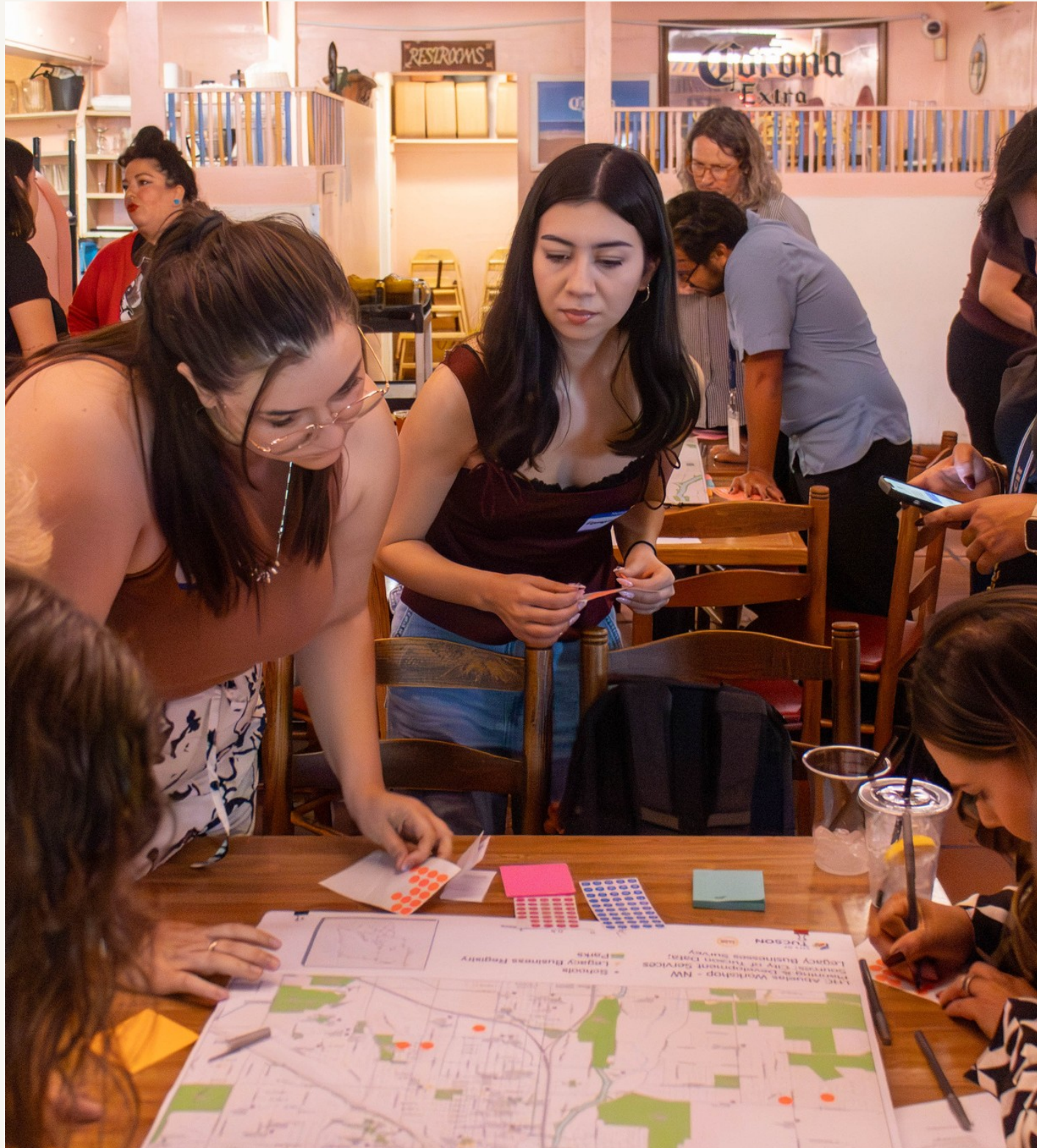
Mapping Workshop by LHC in Tucson, Arizona, USA