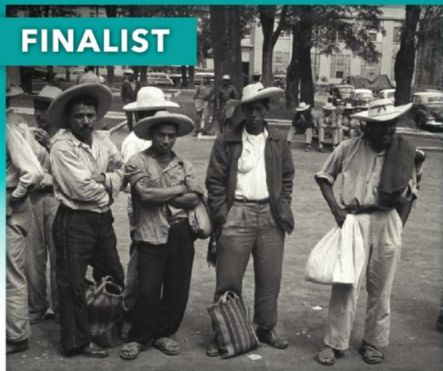
Migrating across the U.S. — Mexican border: A Mexican farmworkers' journey