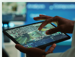
Geospatial Knowledge Infrastructure