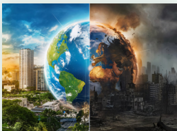
Climate Resilience and Disaster Management