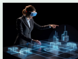
Spatial Computing & Digital Twin