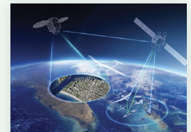
Space & Geospatial Sovereignty