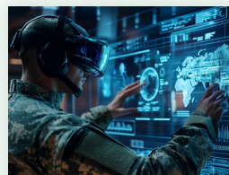
Defence & Intelligence