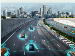
HD Mapping & Autonomy