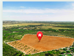
Land & Property