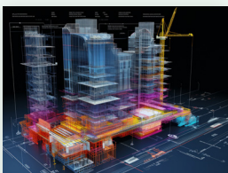
AEC (Architecture, Engineering, and Construction)