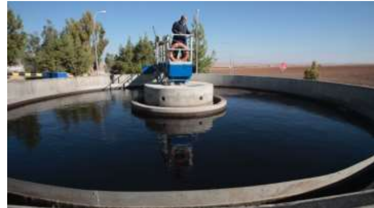
Improvement in the water supply for one million people in Jordan