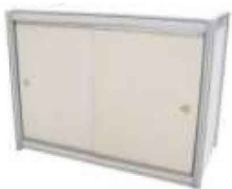
Lockable cupboard Code: PX-03 1030(L)X535(W)X760(H)