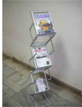
Brochure rack Code: AF-01 300(L)X300(W)X1100(H)