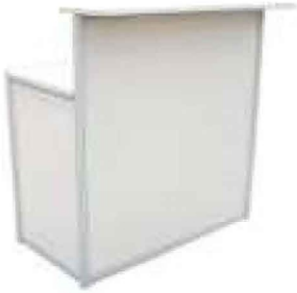
2-tier information counter Code: PX-07 1030(L)X535(W)X1030(H)