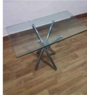
Coffee table Code: TF-01 450(W)X350(D)