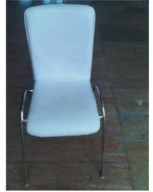
Leather Chair Code: CF-08 450(W)X450(D)X800(H)