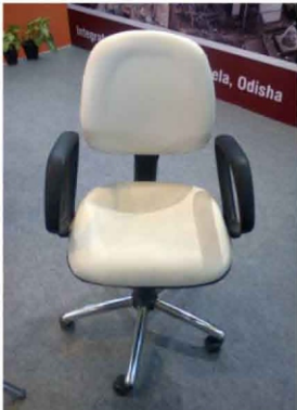
Executive Chair Code: CF-09 620(W)X500(D)X800(H)