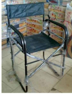
Folding Chair Code: CF-05 450(W)X460(D)X760(H)