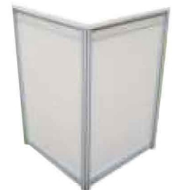
Display cube Code: PX-06 535(L)X535(W)X760(H)