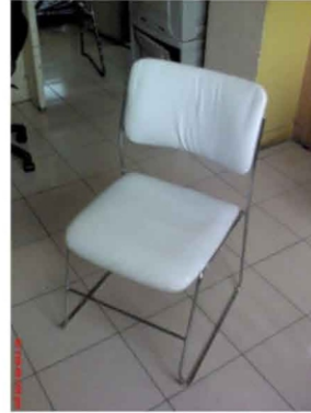
Standard Chair Code: CF-07 460(W) X 460(D)