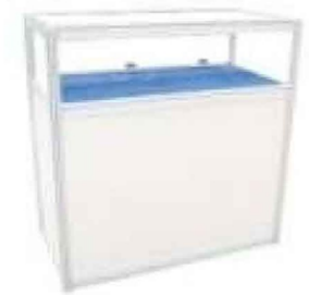
Small showcase Code: PX-02 1030(L)X535(W)X1030(H)