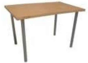
Meeting table Code: TF-02 1200(L)X900(W)X760(H)