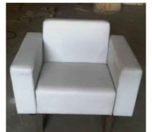
Sofa Code: LF-03 800(W)X750(D)X750(H)