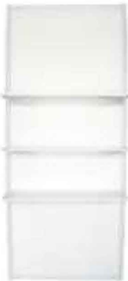
Shelf flat/ sloping Code: DS-01 1000(L)X300(W)