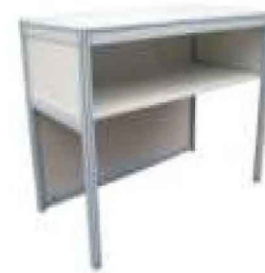
Information counter Code: PX-01 1030(L)X535(W)X760(H)