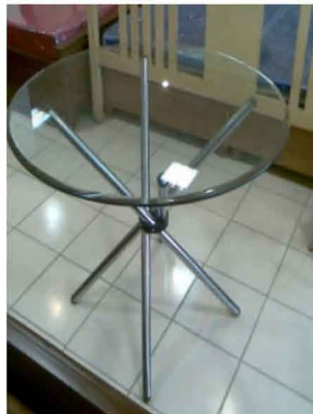
Round table Code: TR-01 850(D)X760(H)