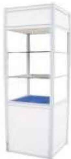
Slim showcase Code: PX-04 535(L)X535(W)X2000(H)