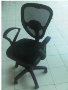
Office Chair Code: CF-10 650(W)X550(D)X800(H)