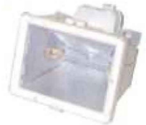
300W helogen flood light Code: LE-07