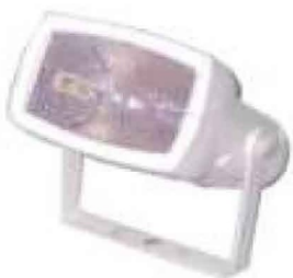
Metal halide 70w/150w Code: LE-08