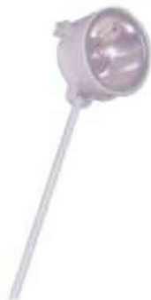
150W long arm helogen Code: LE-02