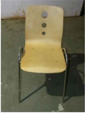
Wooden Chair Code: CF-03 440(W)X480(D)X820(H)