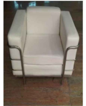
Sofa Chair with arm Code: SF-01 800(W)X750(D)X780(H)