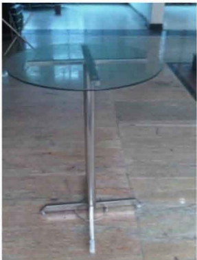
Cocktail table Code: TF-04 600(D)X1075(H)