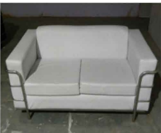
Sofa Chair with arm double Code: SF-02 1700(W)X750(D)X780(H)