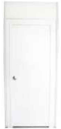
Lockable door Code: AS-03 1000(L)X2440(H)