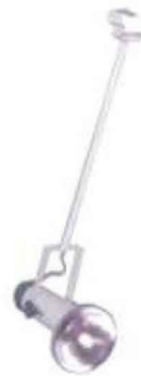
100w long arm sport light Code: le-03