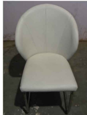
Barcelona Chair Code: CF-11 600(W)X550(D)X760(H)