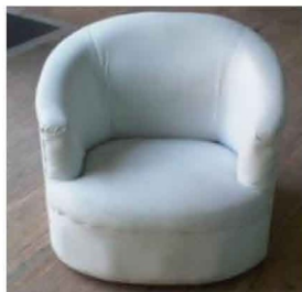
Vegas sofa single Code: LF-01 760(W)X440(D)X750(H)