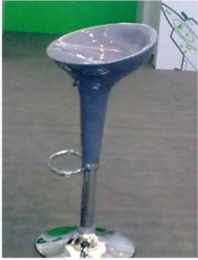
Barstool Code: BF-01 440(W)X480(D)X820(H)