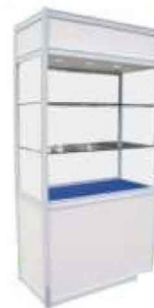
Tall showcase Code: PX-05 1030(L)X535(W)X2000(H)