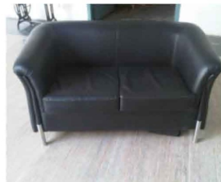
Vegas sofa double Code: LF-02 1290(W)X440(D)X800(H)